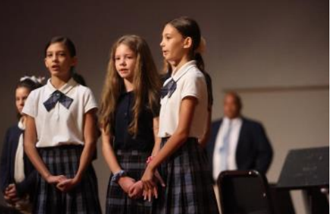
Constitution Day—6th grade students recite Preamble to the Constitution.